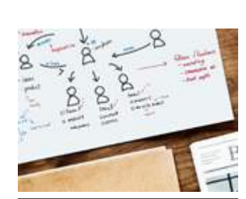
Web Content Management