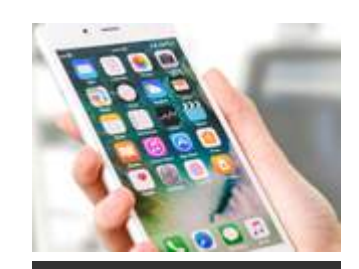
Mobile App Development

This is an excellent opportunity for you to be hired by Hyderabad based IT & Technology Companies including some exciting Start-ups. Here is a list of some of the companies visiting the Campus Fair