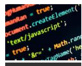
Coding & Programming

B.TECH, B.E or MCA Graduate from 2018/2019 with Minimum 60% and good at