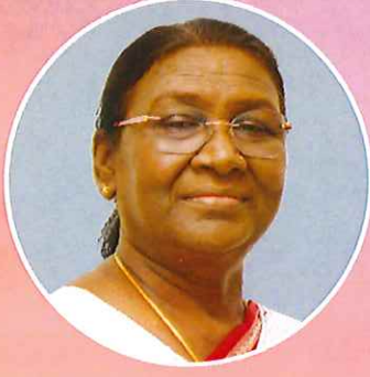
SMT. DROUPADI MURMU Hon'ble President of India