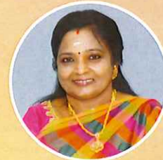
Dr. (Smt.) TAMILISAI SOUNDARARAJAN Governor of Telangana & Lt. Governor of Puducherry