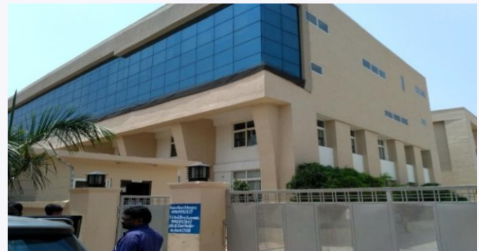
Structural Stability of M/s. Epistemo Vikas,