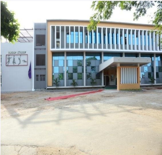
INDOOR STADIUM AT JNTUH, HYDERABAD