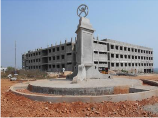
Poof checking of IIT Srikakulam building