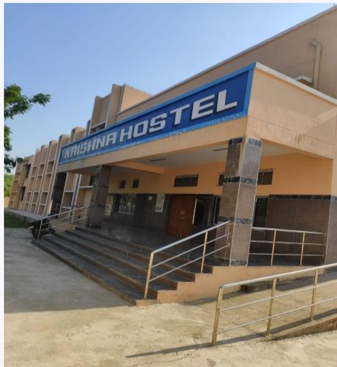
BOYS HOSTEL AT JNTUH JAGITIAL