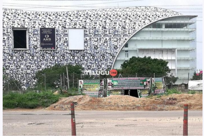
Structural Stability of M/s. AMB Cinemas LLP