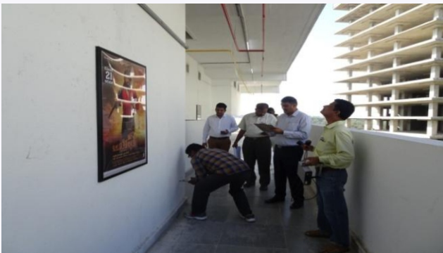
Conducting UPV Test to ascertain quality of quality of concrete (column of 6th floor) M/s. AMB Cinemas LL