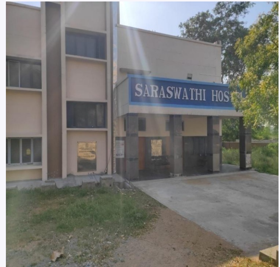
GIRLS HOSTEL AT JNTUH JAGITIAL