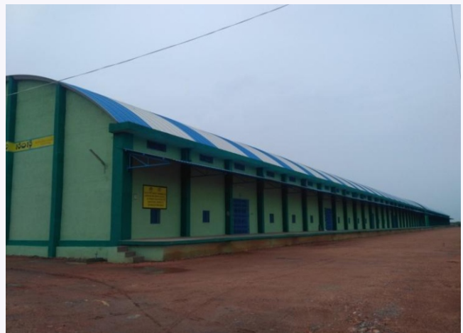
3 rd Party Quality Control test for “ Construction of 10,000 MT Capacity Godowns including ancillary work in Spice park Land” at, Edlapadu, Guntur