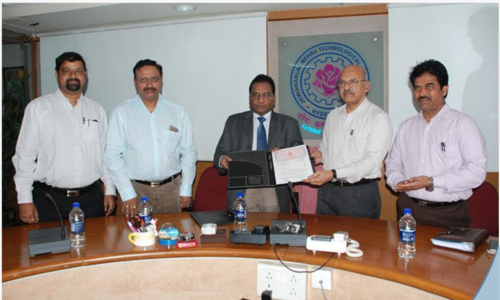
MoU with TATA Consultancy Services Limited (TCS) , Mumbai on 24 th June 2017