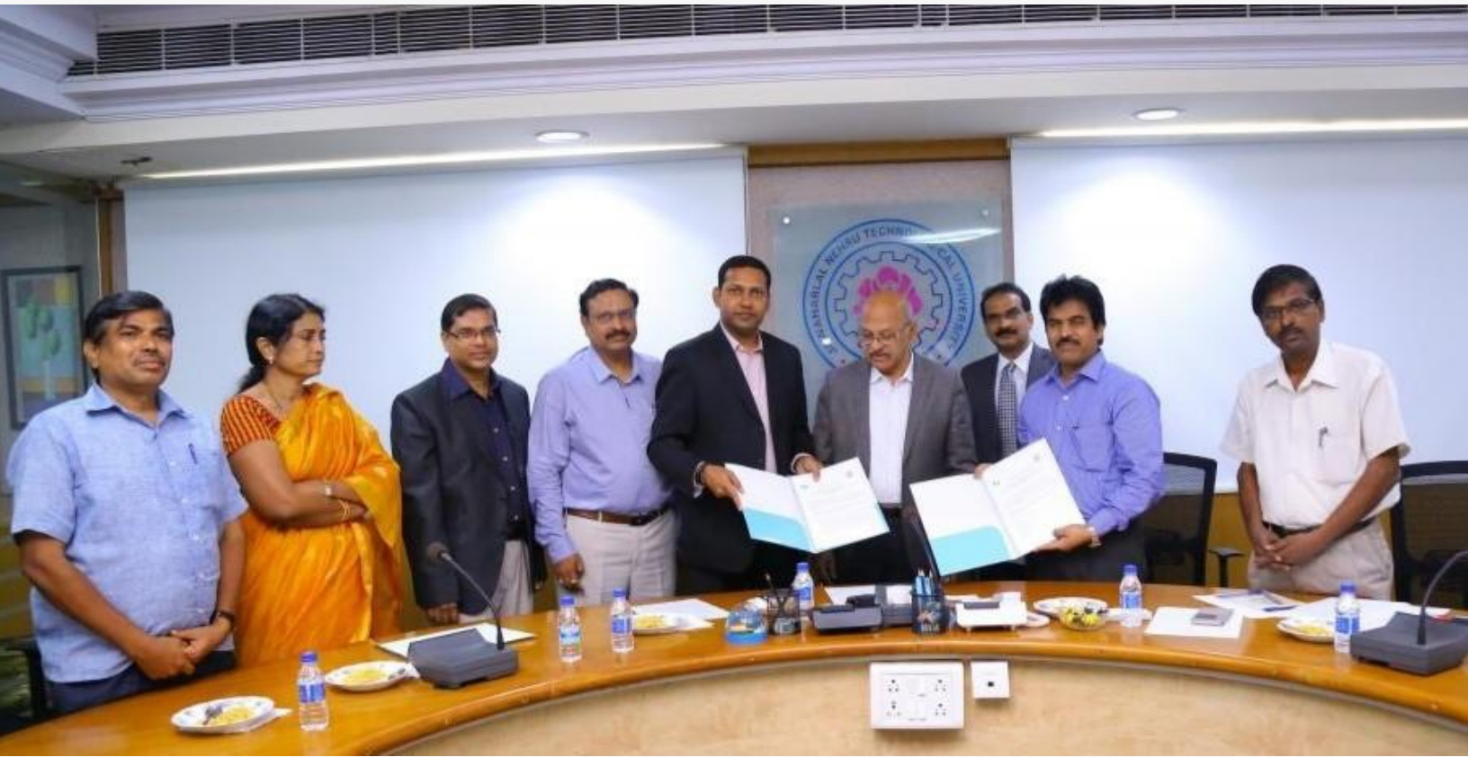
MoU signing with Hexagon Capability Center India(HCCI) Private Limited, Hyderabad on 11 th September 2017.