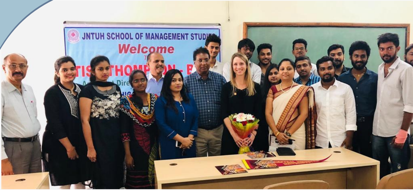
Signing of MoU with officials of Central Michigan University(CMU) , USA on 23 rd July 2017.