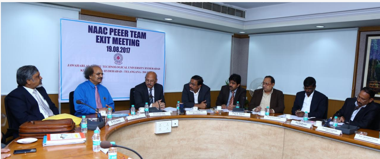
NAAC Peer Team Exit Meeting on 19 th August 2017.