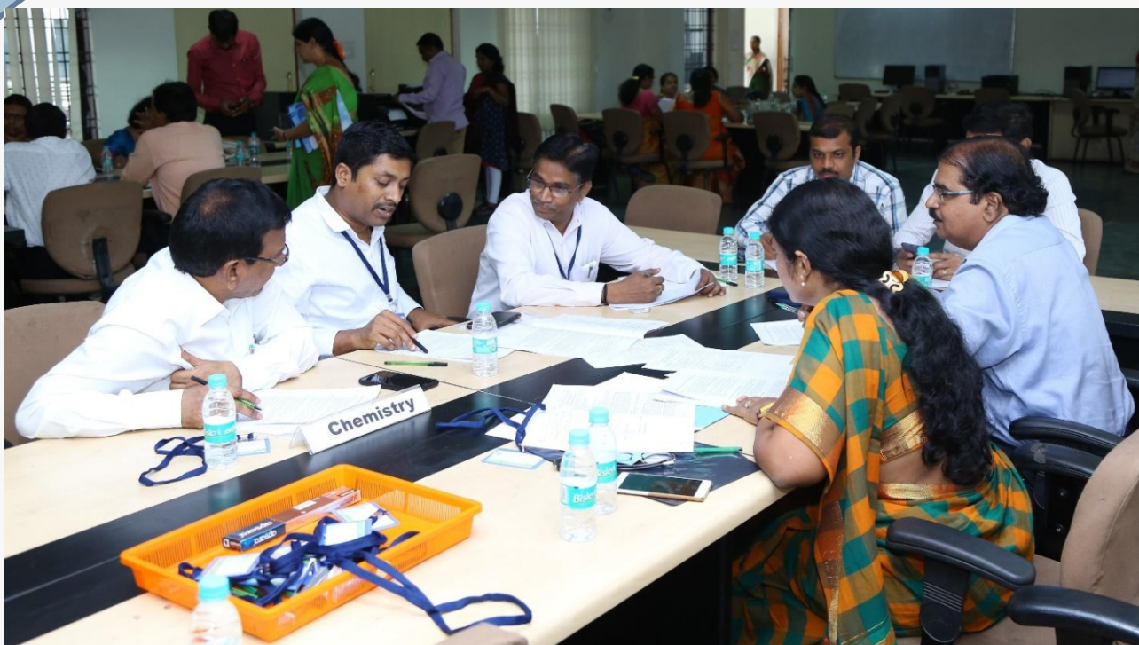
Meeting of Chemistry BOS Members on 24 th May 2018 during Joint Boards of Studies Meetings.