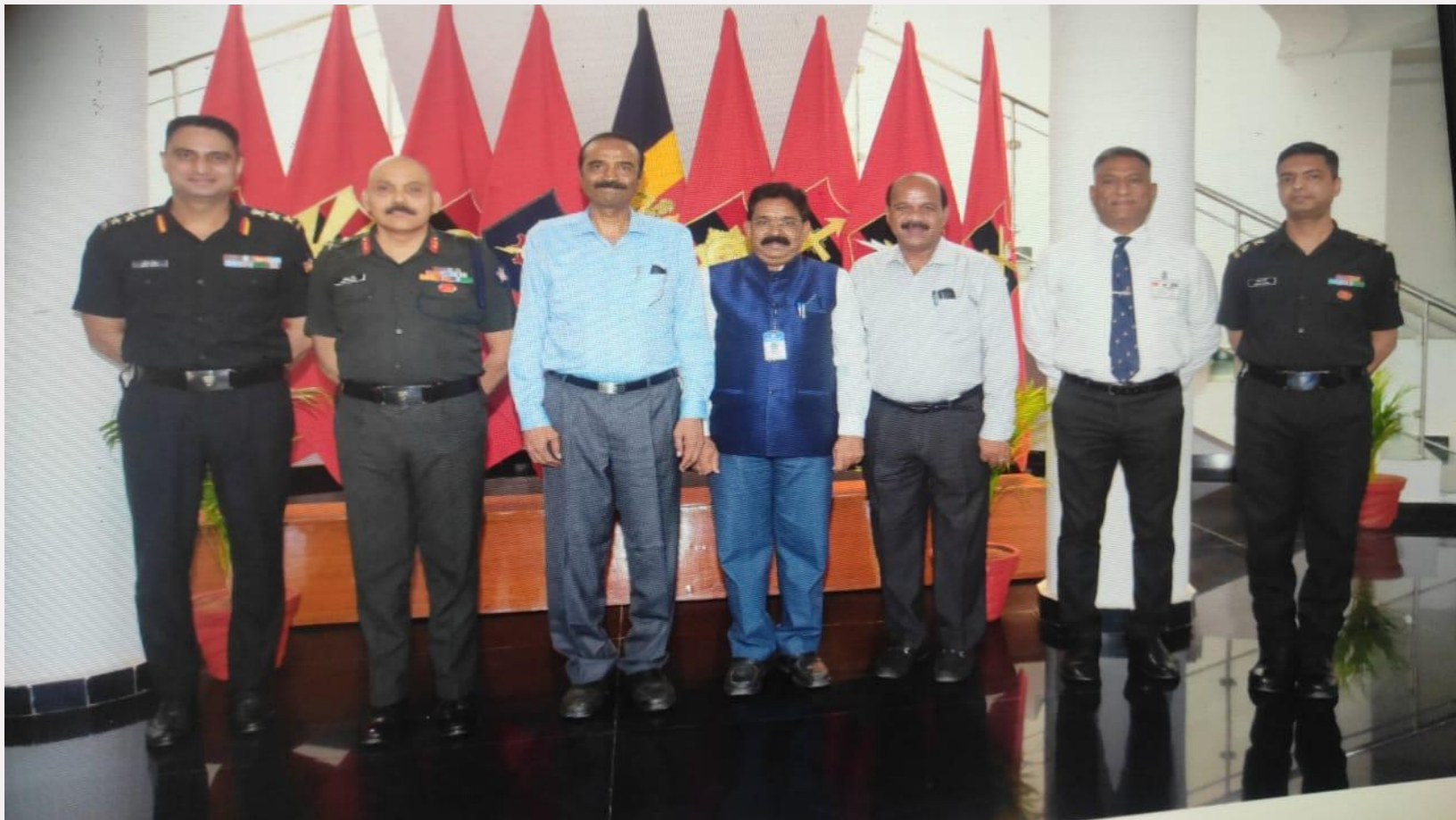
Signing of MoU with officials of Military College of Electronics and Mechanical Engineering, (MCEME) ,Secunderabad on 8 th April 2019.