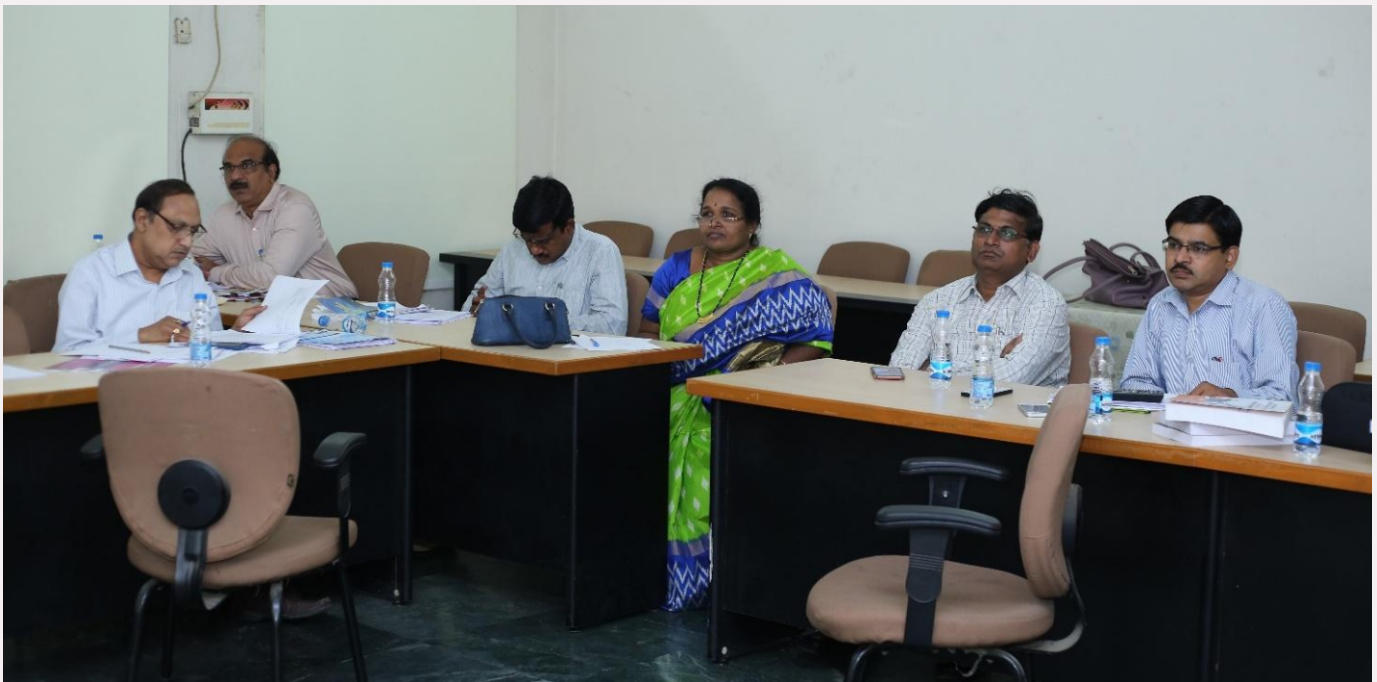
Electrical and Electronics Engineering Board of Studies Members Meeting on 4 th June 2019 during Joint BOS Meetings.