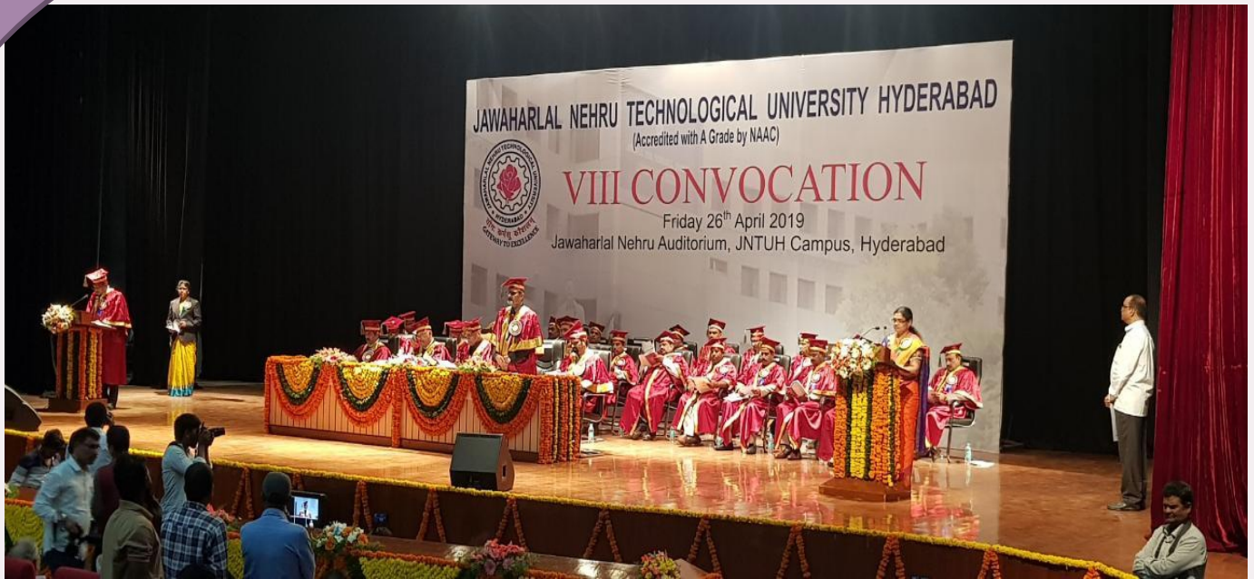
VIII Convocation of JNTUH held on Friday, 26 th April 2019.