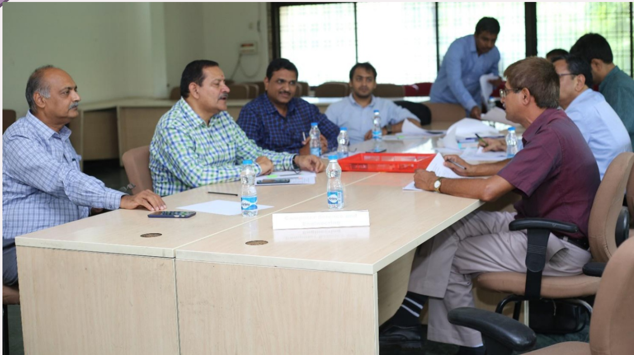
CSE Board of Studies Members Meeting on 4 th June 2019 during Joint BOS Meetings.