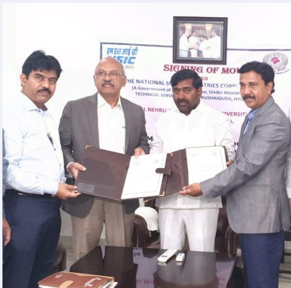
MoU signed with NSIC in the presence of Sri G. Jagadish Reddy, Hon'ble Minister for Education, Government of Telangana on 15 th July 2019.