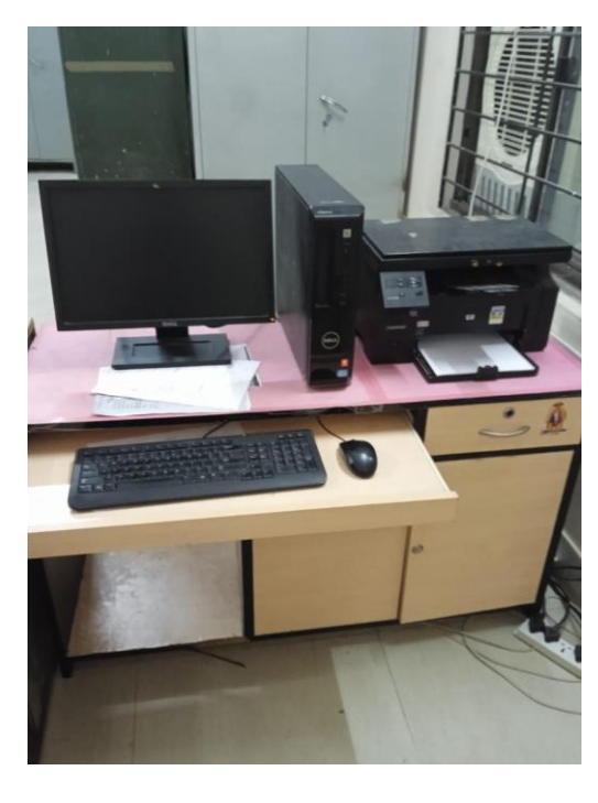
Computer System with printer