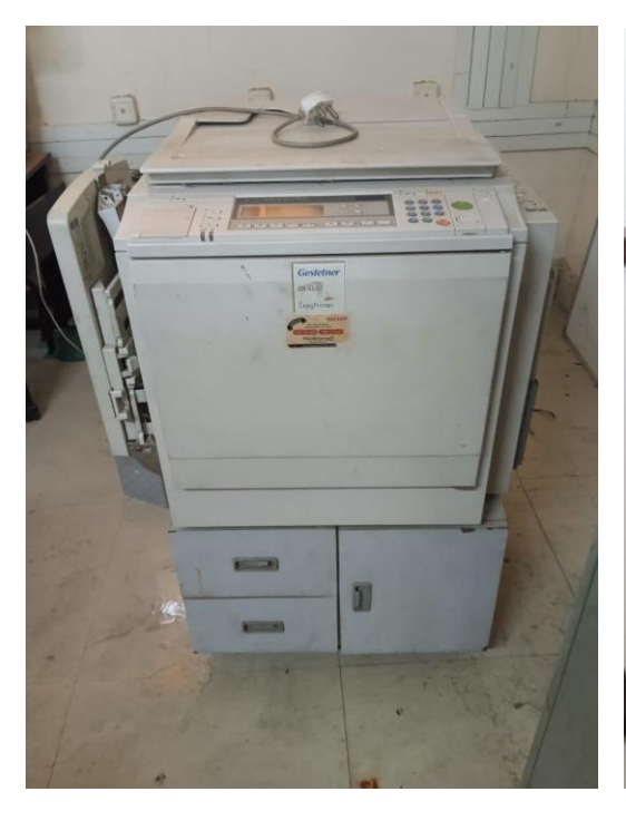
High speed printer