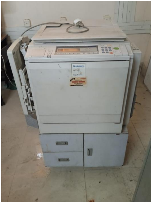
High speed printer