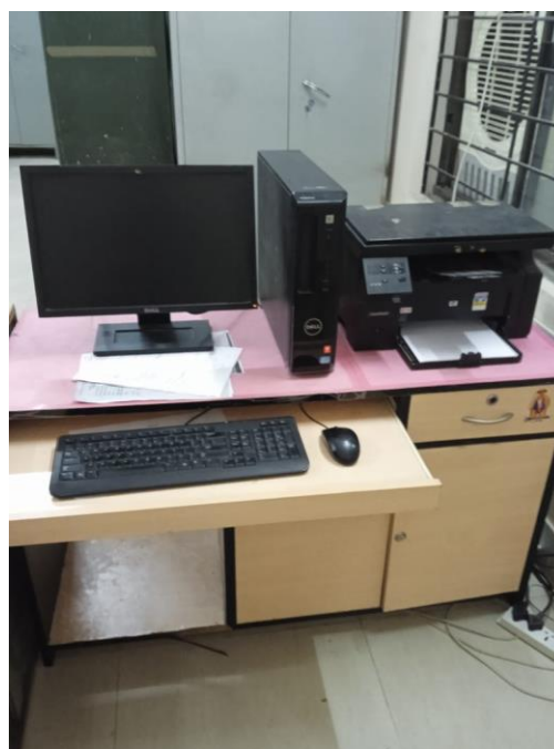
Computer System with printer