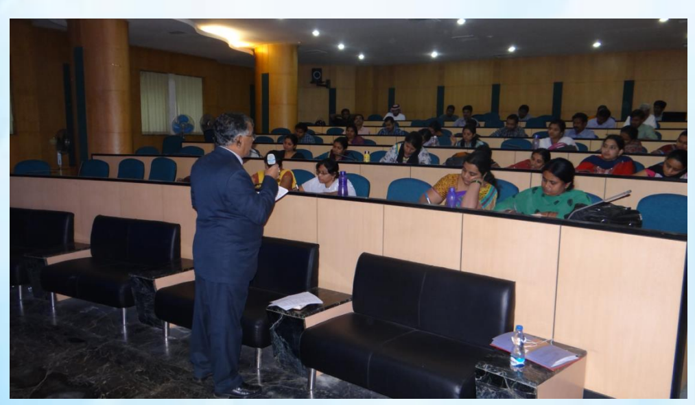
RRM - 2019