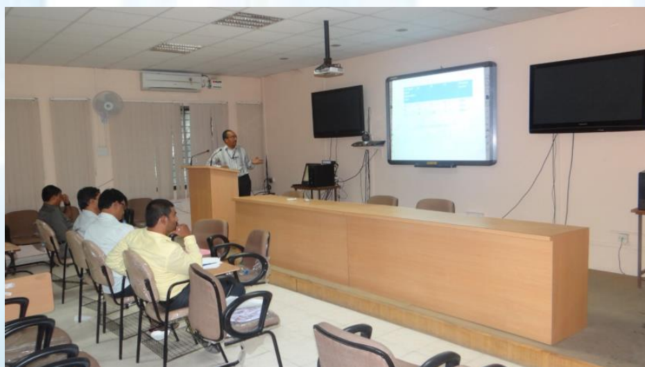
Conduction of Viva Voce