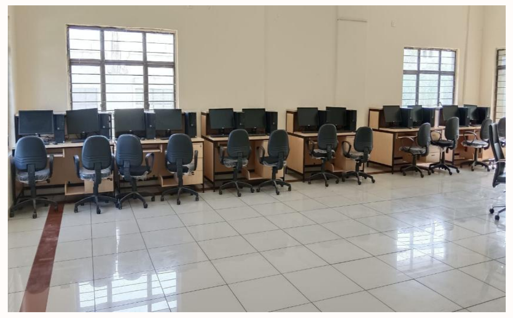
Computer Lab with 30 systems

University Industry Interaction Centre has a computer lab with 30 systems and MATLAB Software to conduct industry oriented training programs. UIIC also has a Conference room to facilitate meetings and discussion with industry experts and HRs.