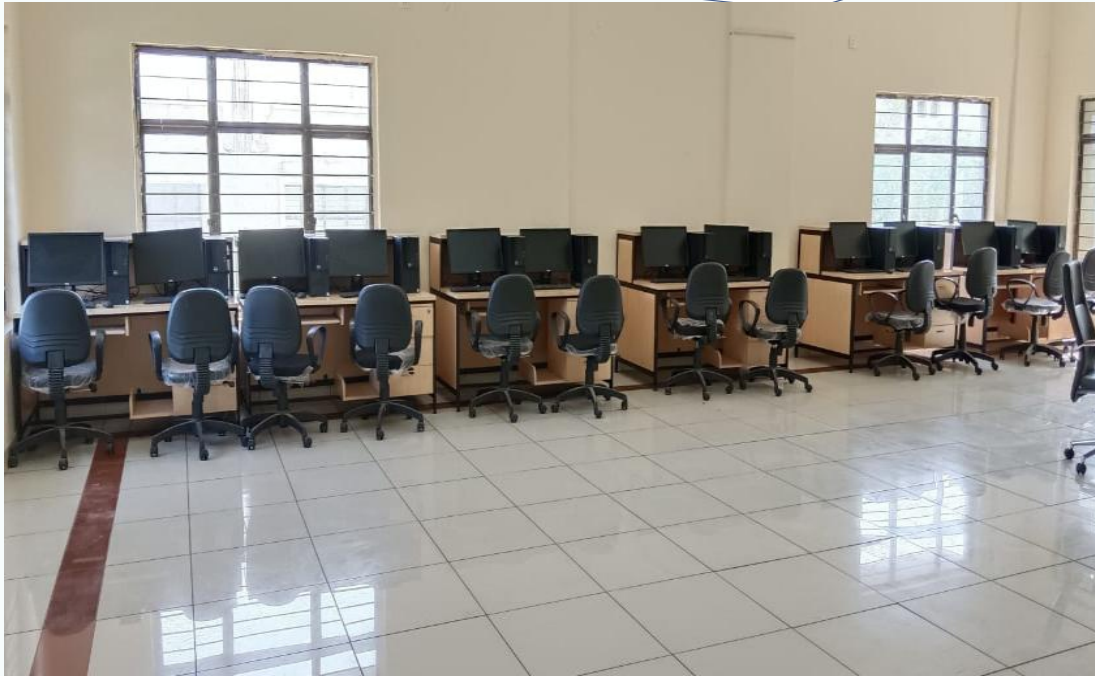
Computer Lab with 30 systems